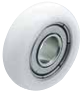
GRL-P-U-SUS (Without Stud)