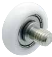
GRL-M-P-U-SUS (With Stud)