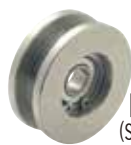
GRL-H-SUS (Stainless Steel)