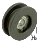
GRL-SH-H (Hardened Steel)