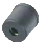
EBPJ (Plastic Ball)