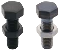
(Steel) (Stainless steel)